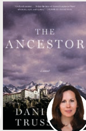
Danielle Trussoni The Ancestor NOVEL

You may not know Zweibel's name, but you've likely laughed at his SNL sketches for Gilda and Belushi or his meta It's Garry Shandling's Show . In this jokey retrospective, he drops bons mots like bonbons about Billy Crystal, Farrah Fawcett, Woody Allen and more. It's medicine we can all use right now.